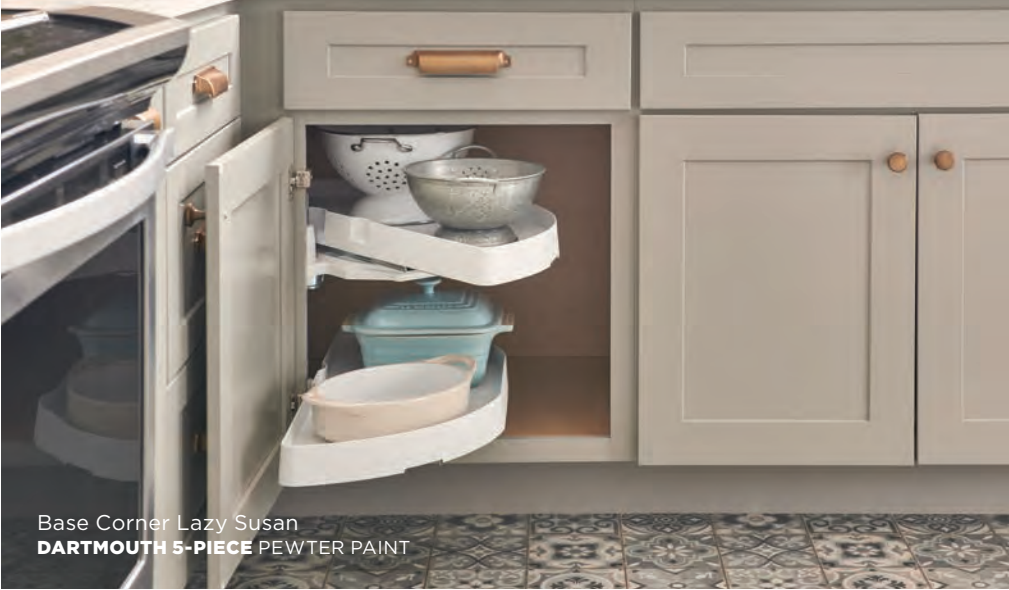
Base Corner Lazy Susan DARTMOUTH 5-PIECE PEWTER PAINT

When designing Wolf Classic cabinets, we had both form and function in mind. From food storage to recycling, these simple solutions will make your space work hard for you.