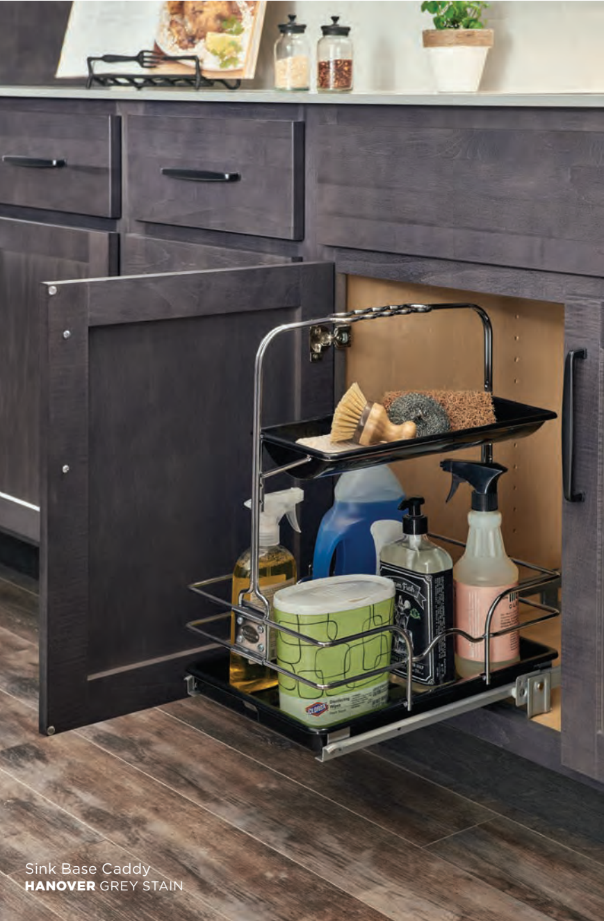
Sink Base Caddy HANOVER GREY STAIN