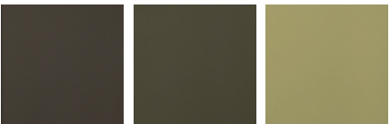
Stonybrook Juniper Laurel