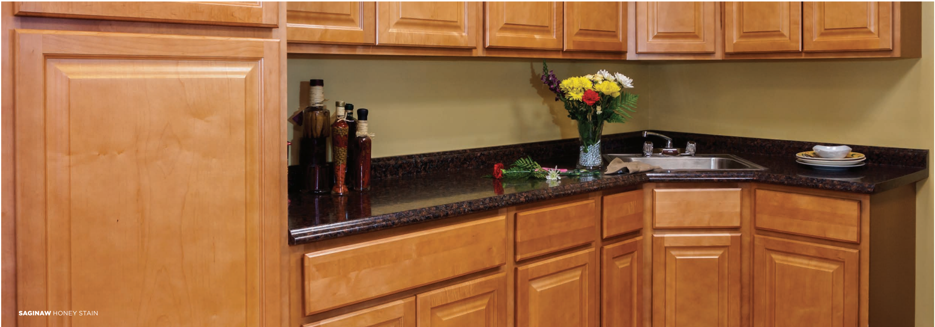
SAGINAW HONEY STAIN