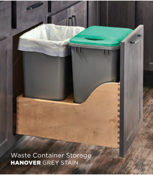
Waste Container Storage HANOVER GREY STAIN