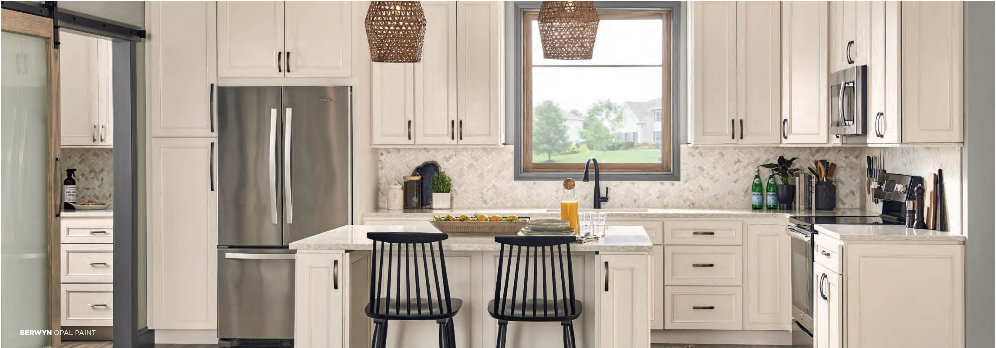
BERWYN OPAL PAINT

Berwyn combines tradition and elegance. This full overlay door is available exclusively in our Opal Paint, which combines the warmth of white with cool grey undertones.