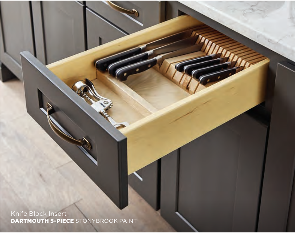
Knife Block Insert DARTMOUTH 5-PIECE STONYBROOK PAINT