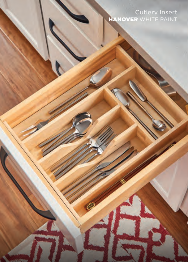
Cutlery Insert HANOVER WHITE PAINT