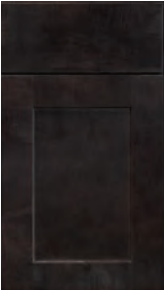
Dark Sable Stain