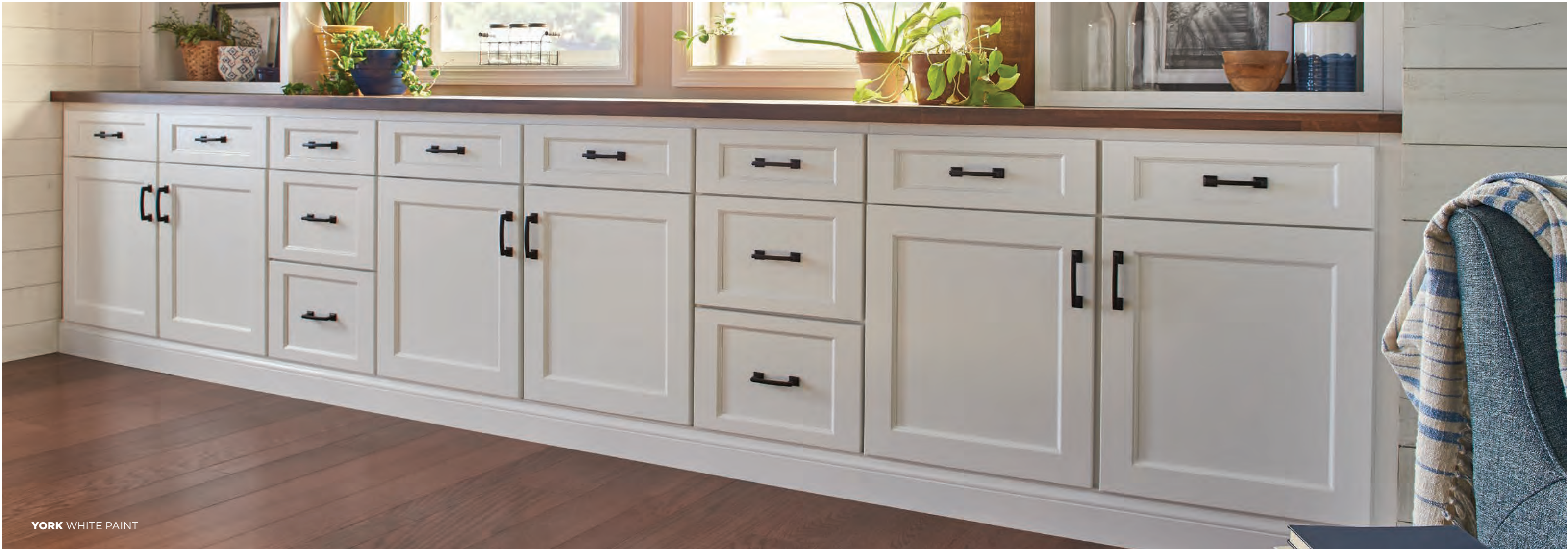
YORK WHITE PAINT