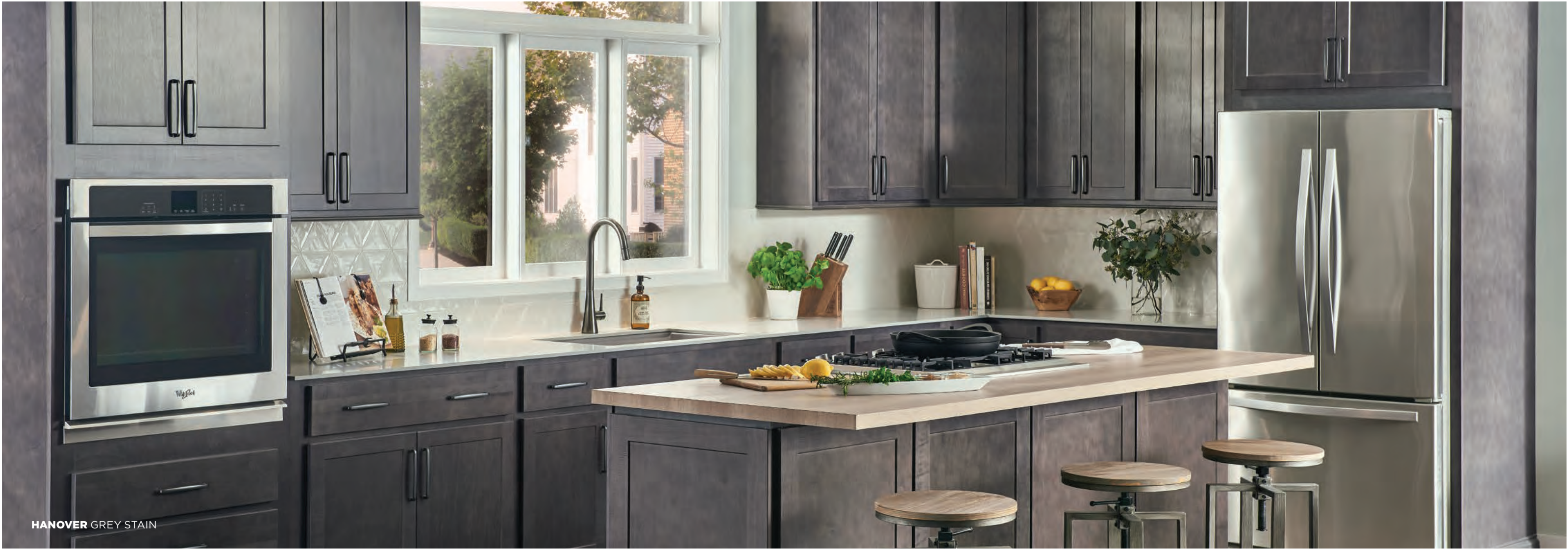
HANOVER GREY STAIN