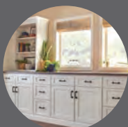
Kitchen & Bath

Find us on Instagram @ wolfhomeproducts for inspiration on your next project!