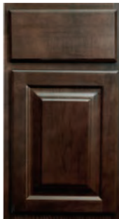
Dark Sable Stain