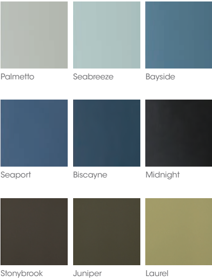
Palmetto Seabreeze Bayside Seaport Biscayne Midnight Stonybrook Juniper Laurel