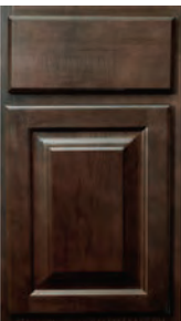
Dark Sable Stain