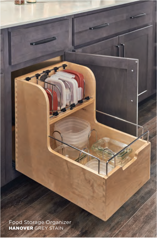
Food Storage Organizer HANOVER GREY STAIN