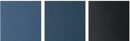
Seaport Biscayne Midnight