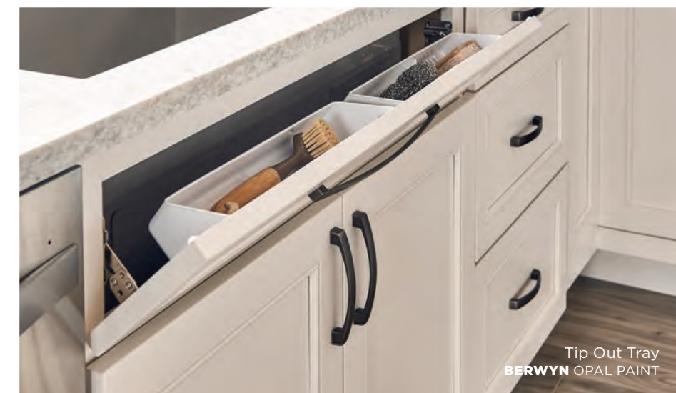
Tip Out Tray BERWYN OPAL PAINT