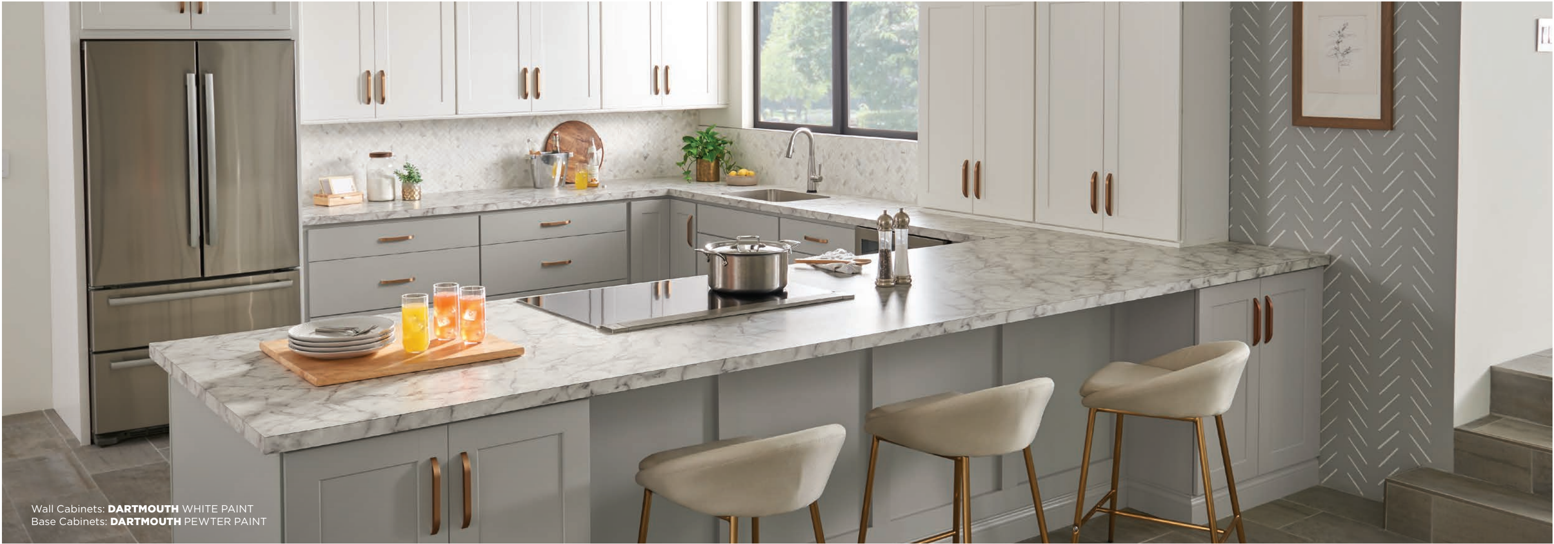
Wall Cabinets: DARTMOUTH WHITE PAINT Base Cabinets: DARTMOUTH PEWTER PAINT