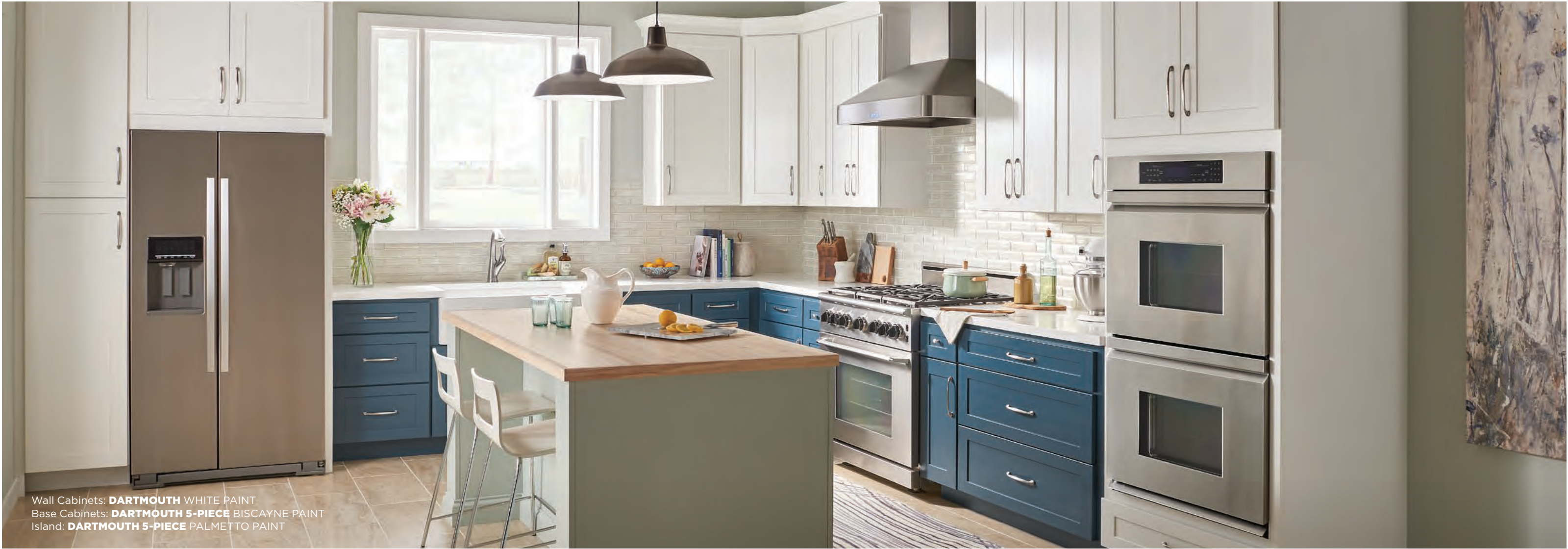
Wall Cabinets: DARTMOUTH WHITE PAINT Base Cabinets: DARTMOUTH 5-PIECE BISCAYNE PAINT Island: DARTMOUTH 5-PIECE PALMETTO PAINT

The popular and contemporary Dartmouth style offers a little added flair with 5-piece drawer fronts. Available in Pewter and White Paint or Grey Stain, these doors and drawers are sure to bring class and distinction to any kitchen.