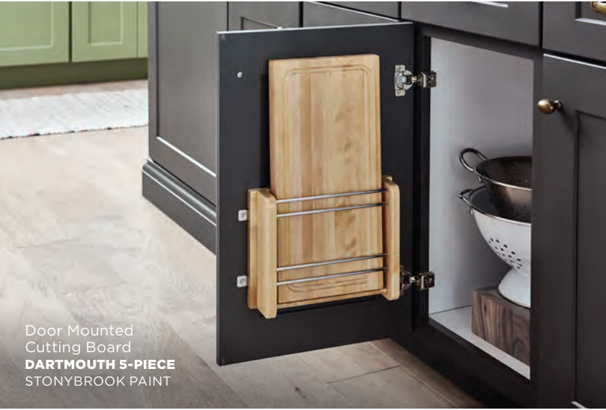
Door Mounted Cutting Board DARTMOUTH 5-PIECE STONYBROOK PAINT