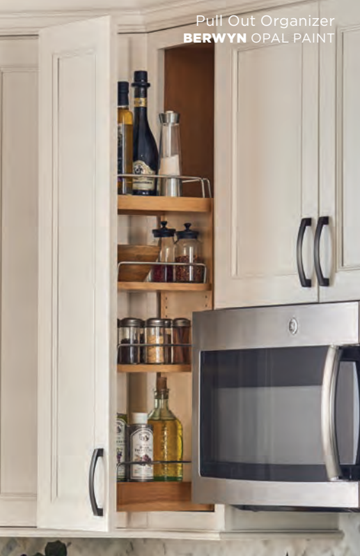
Pull Out Organizer BERWYN OPAL PAINT