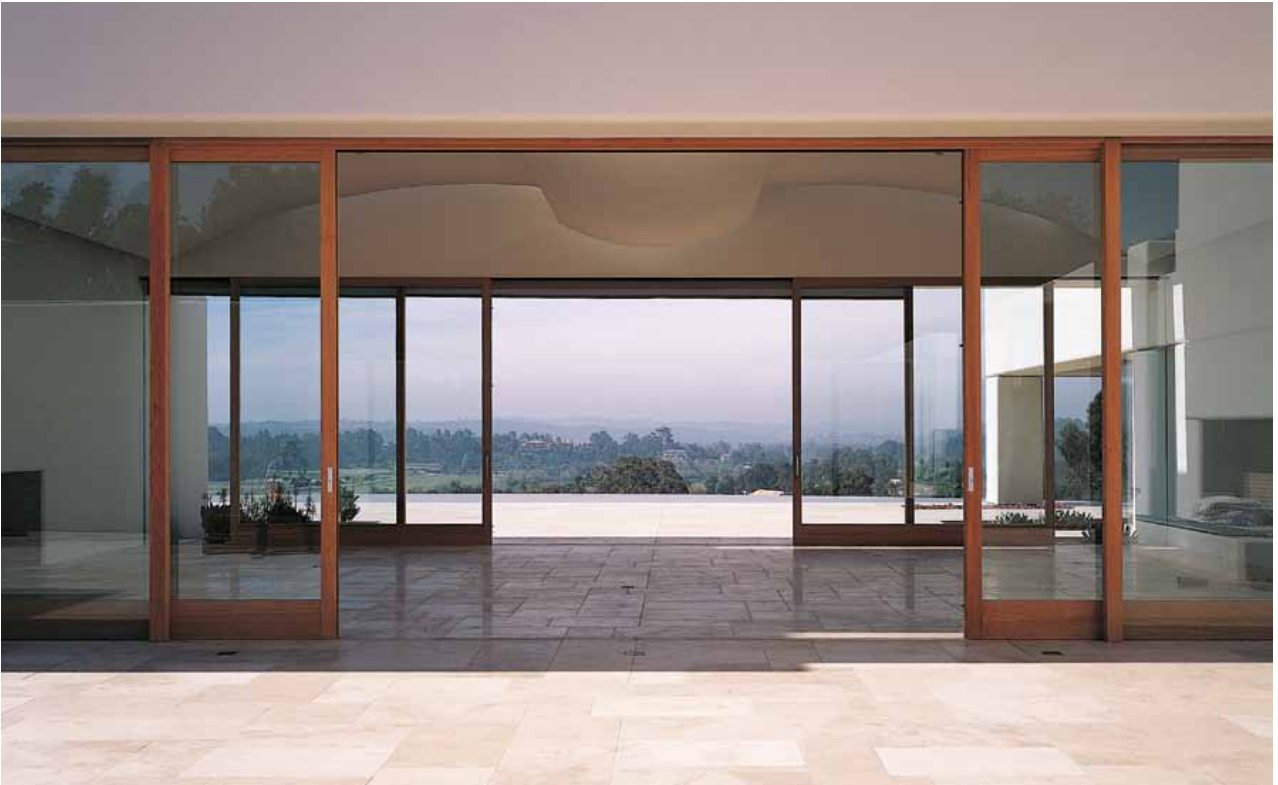
Above: An all wood Liftslide in a contemporary residence. Below: Micah Children's Academy, Brentwood, Tennessee.