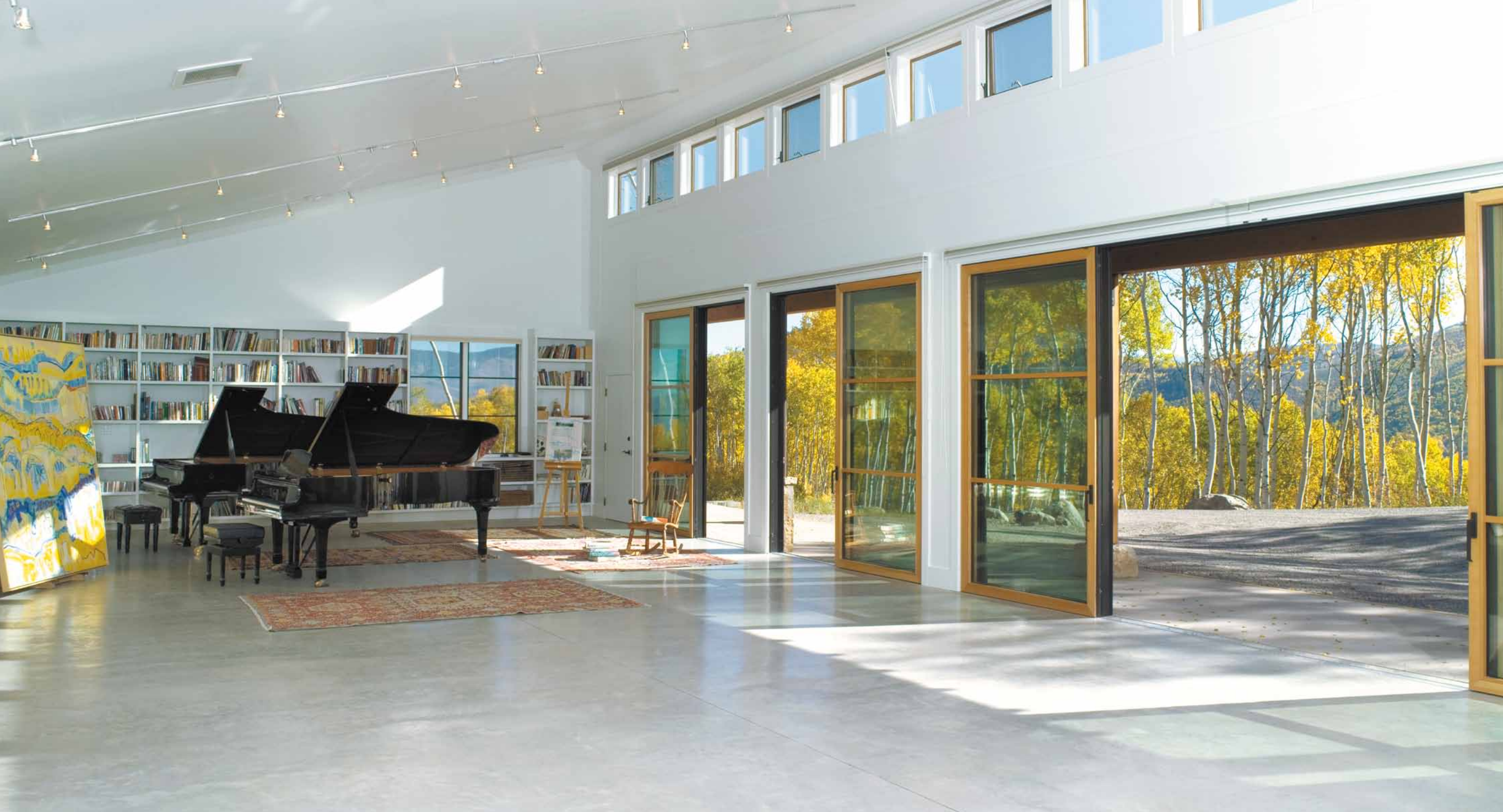
Aluminum wood Liftslides open up an art and music studio in Edwards, Colorado.