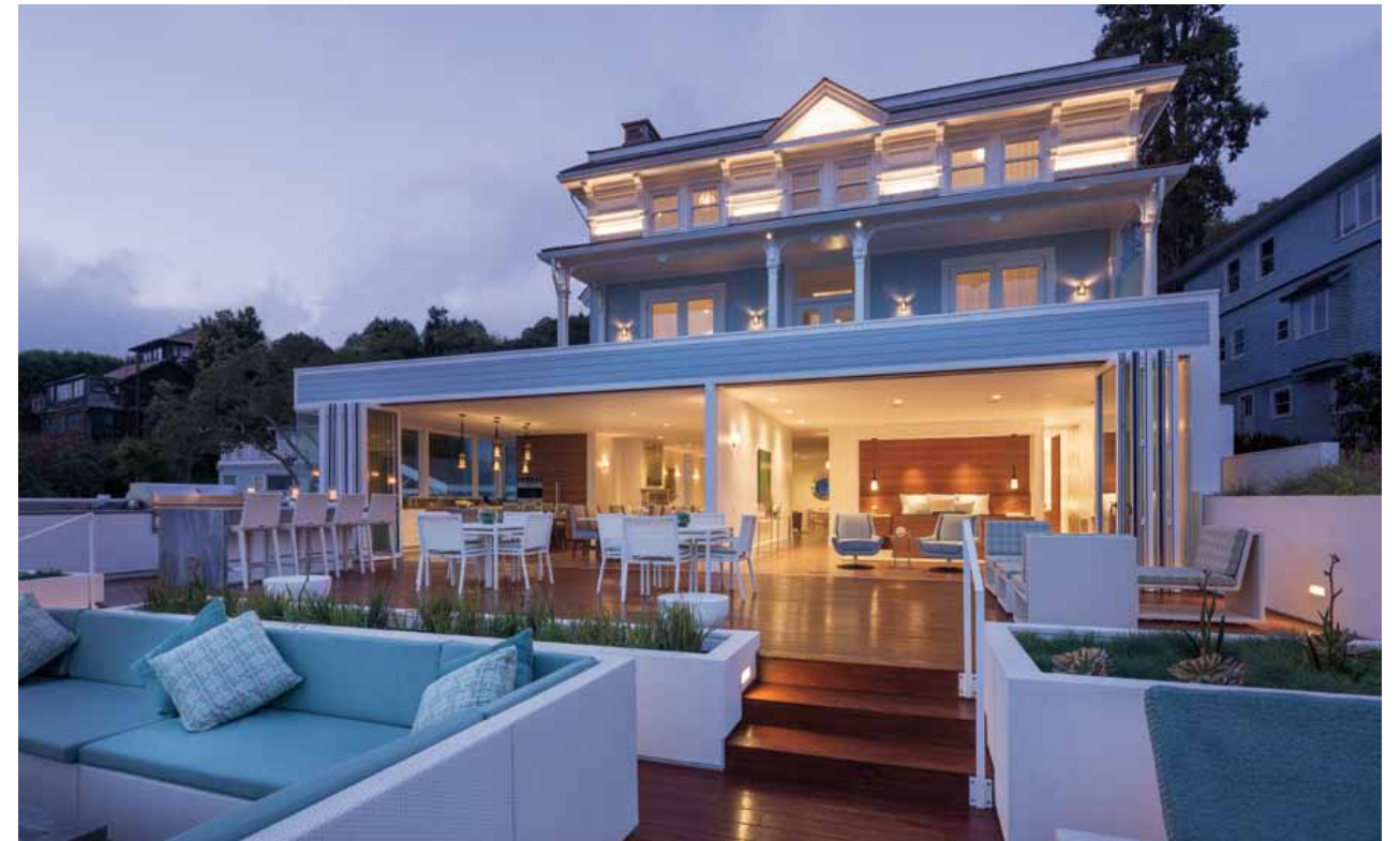
Above: Alexandrite Suite, Casa Madrona Hotel & Spa.