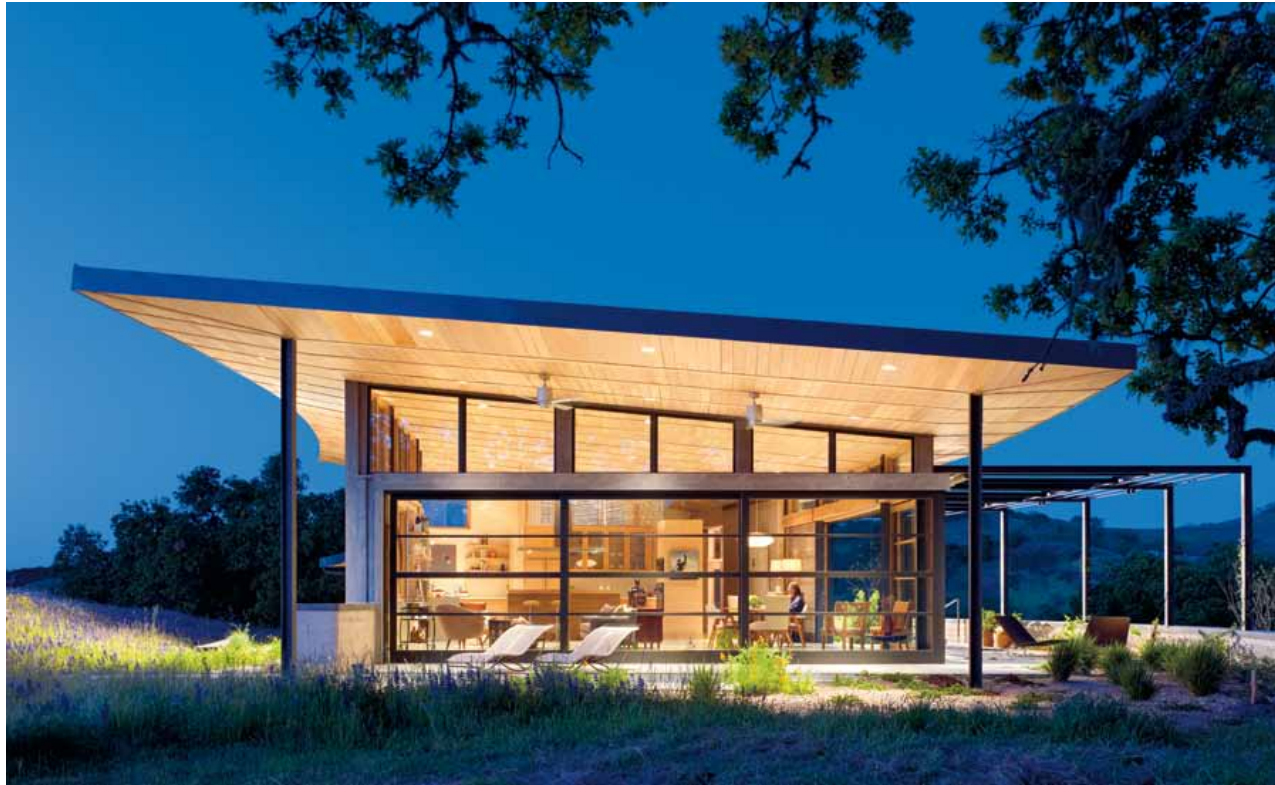
Above: Curved, corner Liftslides with SDL bars.