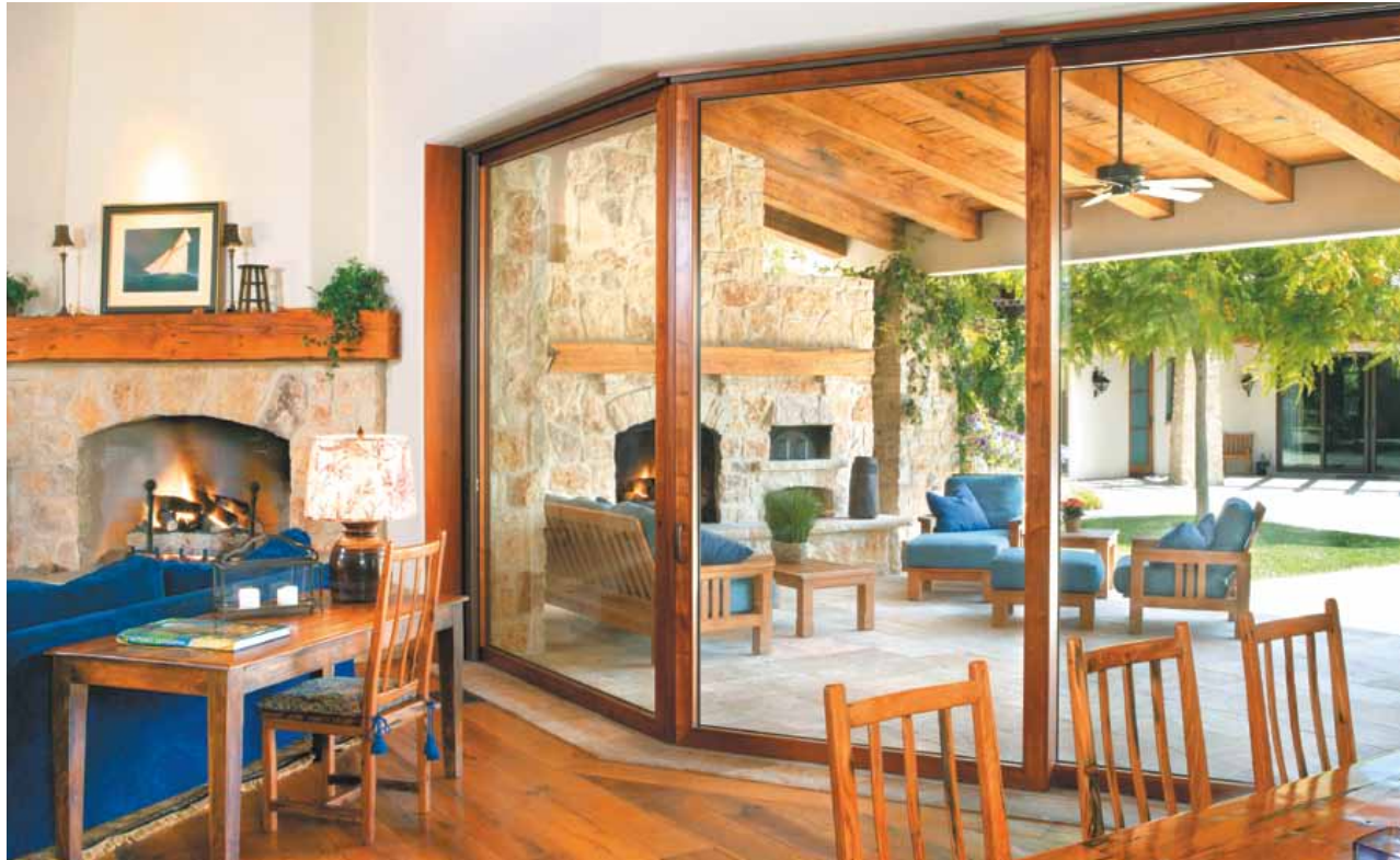
Above: A custom angled, pocketing aluminum wood Liftslide. Below: A Liftslide used as a pocketing window at Napa Valley's Kenzo Winery.