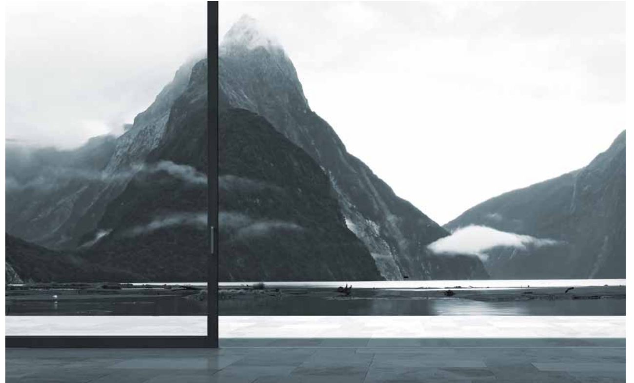
Above: The Weiland flush track elegantly connects indoor and outside spaces.