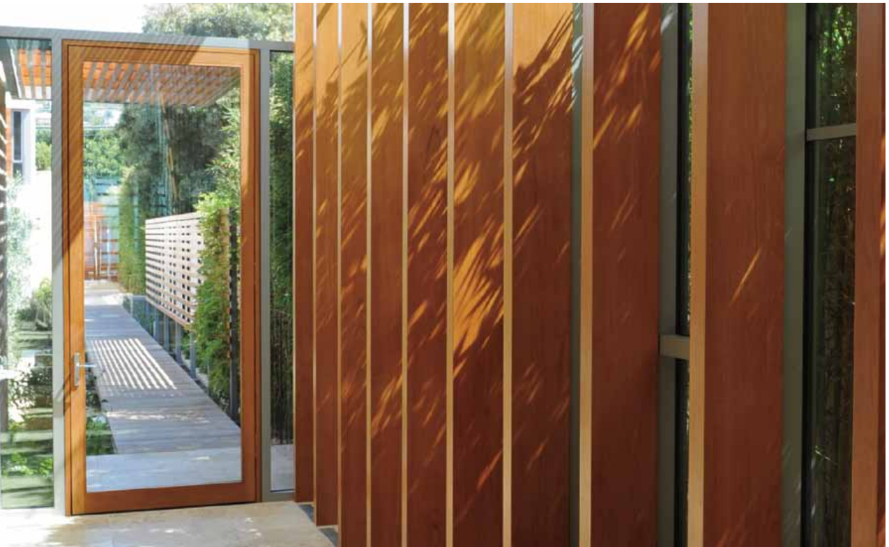
Above: A swing door creates a spacious entry.