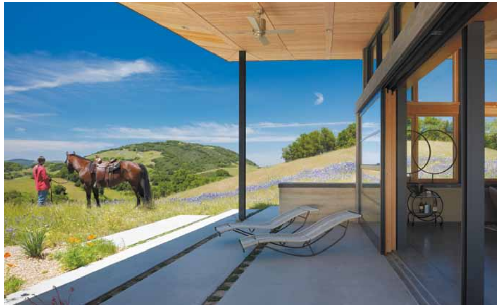
Caterpillar House, LEED Platinum.