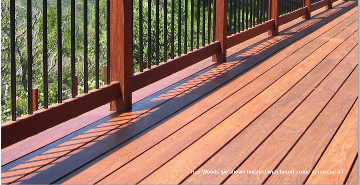
Iron Woods Ipe shown finished with tinted exotic hardwood oil