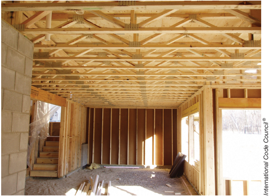
Open web floor trusses requiring membrane protection on the underside

nominal 2 \times 10 s or larger of these materials are exempt from these fire protection requirements. Fire protection also is not required if sprinklers are installed to protect the space below the floor assembly.